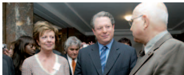
From left to right: Commissioner Kroes, Al Gore, Commissioner Dimas

Mr. Gore’s visit to Belgium, Prime Minister Guy Verhofstadt, whom Mr. Gore spoke to during his brief stay in Brussels, initiated a number of far-reaching and ambitious proposals to fight climate change and put Europe on an energy efficient and sustainable path.