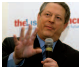
Al Gore at Lisbon Council reception