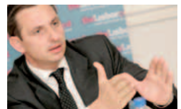
Jorgo Chatzimarkakis, MEP and rapporteur of the Competitiveness and Innovation Programme (CIP)

Together with Jorgo Chatzimarkakis , member of the European Parliament and rapporteur of its Competitiveness and Innovation Programme (CIP), the Lisbon Council launched a new policy network for progressive, future-oriented leaders from the EU institutions, as well as business, academia and civil society. The aim of the Zukunftssalon is to build a political space where pertinent issues can be discussed in a forward-looking, non-ideological and pragmatic atmosphere. The first Zukunftssalon, held on 08 November, focused on Skills for the Future . The second one, held on 04 December, explored the economic and social benefits of Consumer Empowerment .