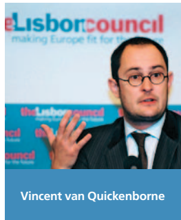
Vincent van Quickenborne